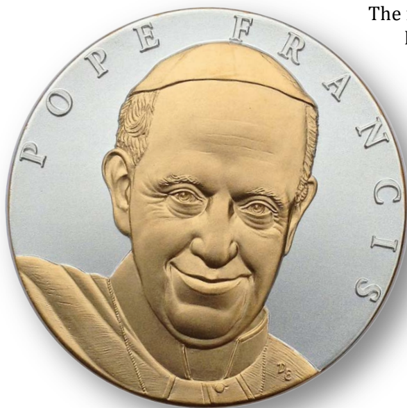
Pope Francis Silver Medal

project is an opportunity to employ those that may have difficulty in the job place. Both causes are good and the collaboration is a perfect match.